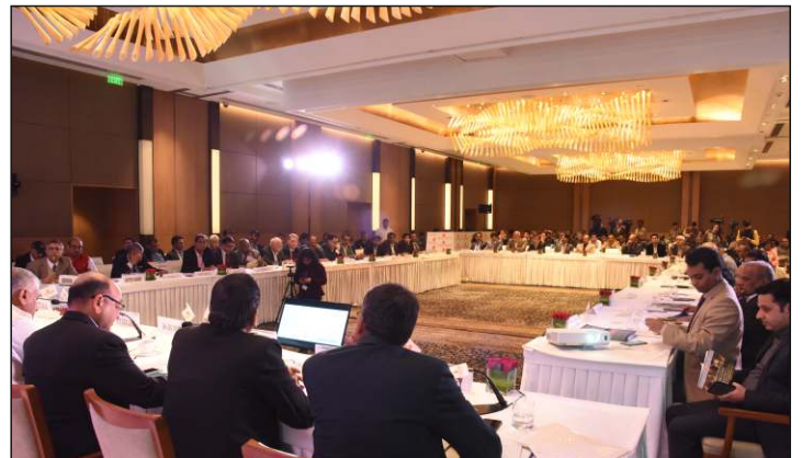
Industry presence at the Roundtable Discussion with Shri Nitin Jairam Gadkari, Hon'ble Union Minister for Road Transport and Highways