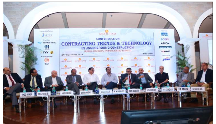
Conference on Contracting Trends & Technology in Underground Construction, 27th September 2022 at New Delhi