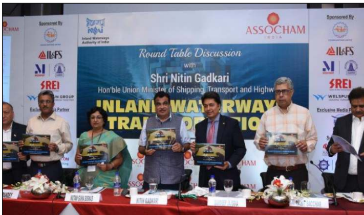
Round Table Discussion with Shri Nitin Gadkari on Inland Waterways and Transportation, July 2018 at New Delhi