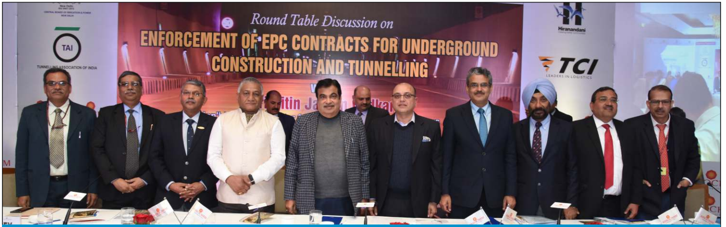
Round Table Discussion on Enforcement of EPC Contracts for Underground Construction and Tunnelling, 12th February 2022 at New Delhi