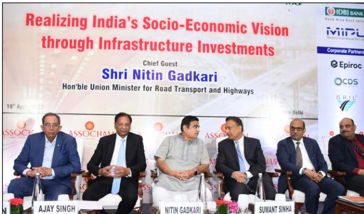
Realizing India's Socio-Economic Vision through Infrastructure Investments, 19th April 2022 at New Delhi