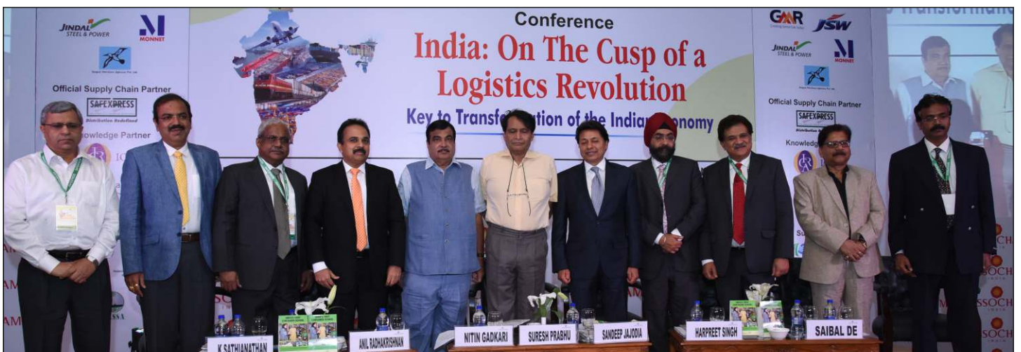
Conference: India - on the Cusp of a Logistics Revolution, Key to Transformation of the Indian Economy, July 2017 at New Delhi